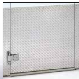
Door & frame kickplates (shipped loose)