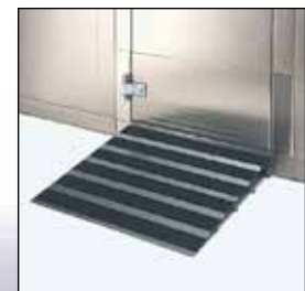
Exterior floor ramps